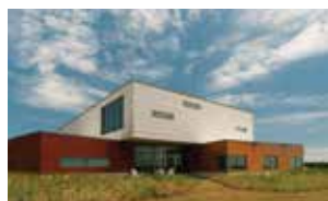
DUKE MARINE LAB BEAUFORT, NC