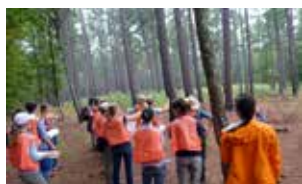
DUKE FOREST DURHAM, NC