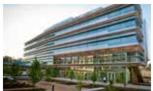
GRAINGER HALL + LSRC DURHAM, NC