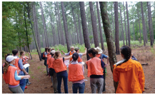
DUKE FOREST DURHAM, NC