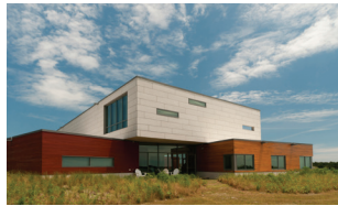
DUKE MARINE LAB BEAUFORT, NC

If you are a working professional with at least five years of environmentally-related experience, there is the two-year Duke Environmental Leadership online MEM degree . This program's flexible structure allows students to develop a highly transferrable leadership-driven skill set in a manner that is both convenient and efficient.