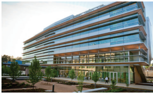
ENVIRONMENT HALL + LSRC DURHAM, NC